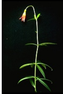
© 1995 Saint Mary's College of California