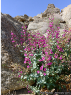
Keir Morse 2015