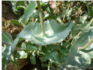
Keir Morse 2015